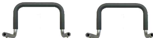
Arms (left and right)